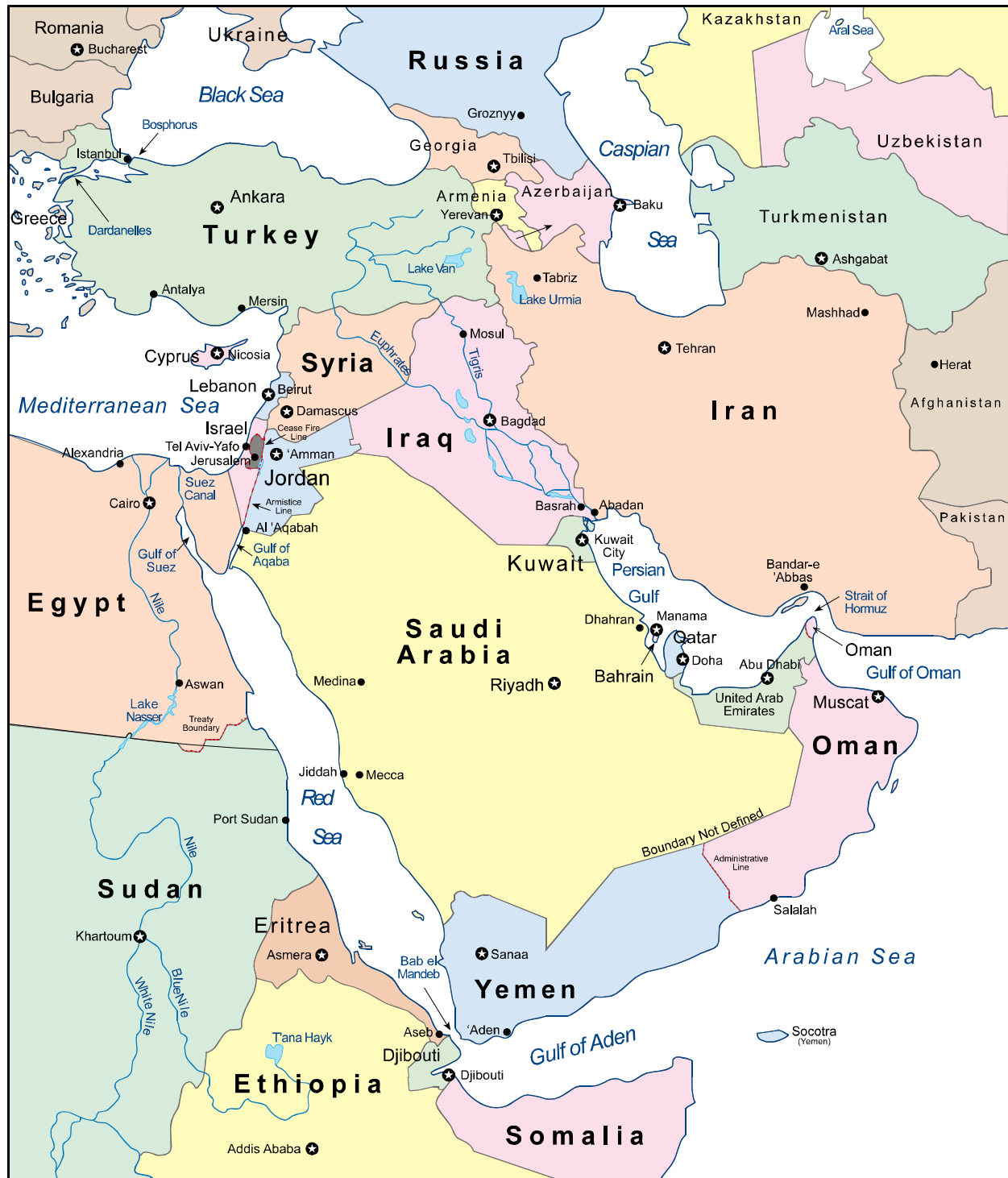
Figure 2. Map of the Persian Gulf Region and Environs

Adapted by CRS from Magellan Geographix. Used with permission.