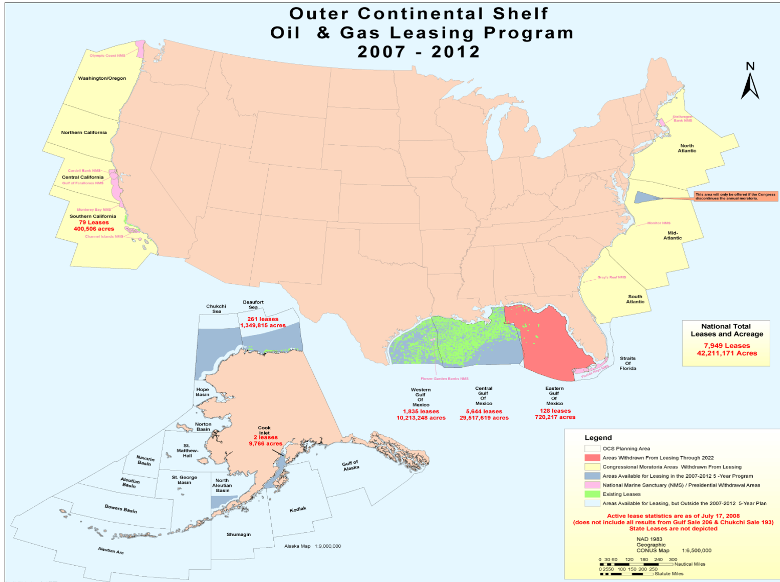
Figure 1. MMS Five-Year Program Areas

MMS defines the OCS as submerged lands, subsoil, and seabed between the seaward extent of states' jurisdiction and the seaward extent of federal jurisdiction.