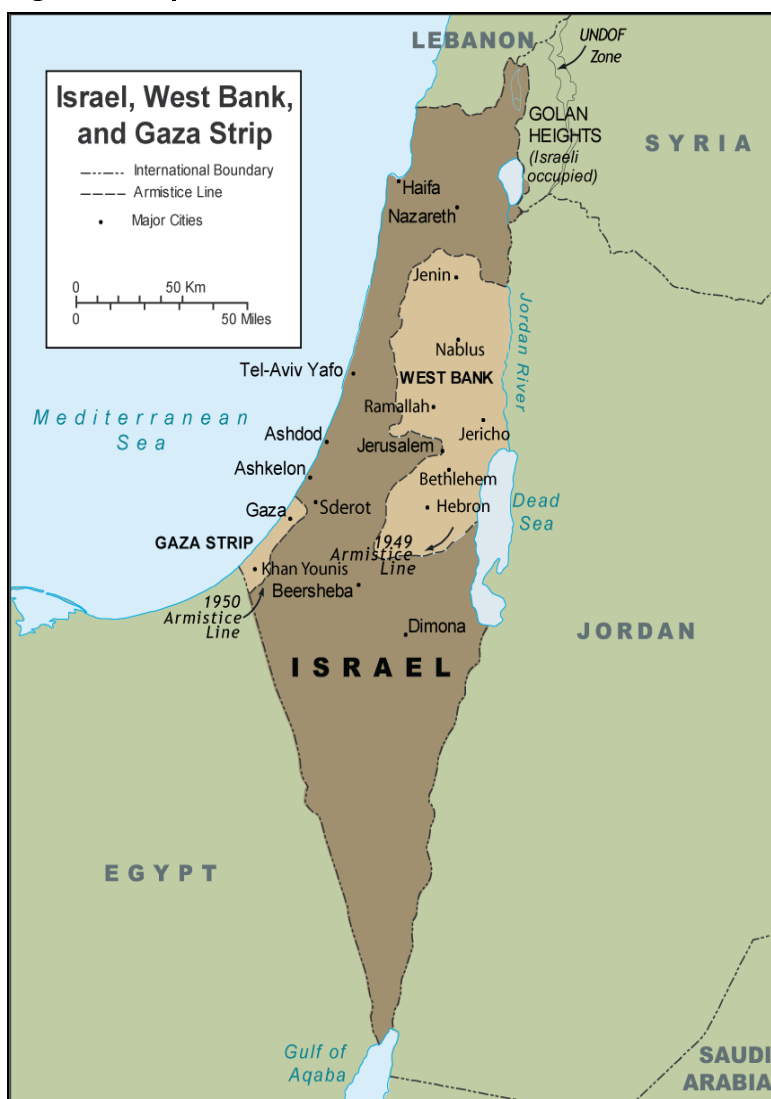
Figure 1. Map of Israel, the West Bank, and the Gaza Strip