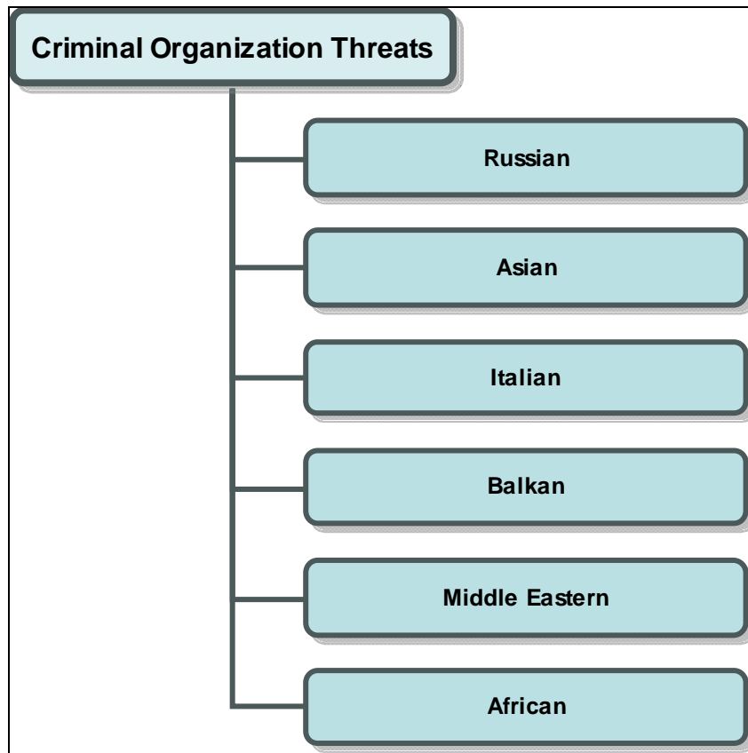
Figure 3. Organized Crime Threats in the United States According to the FBI