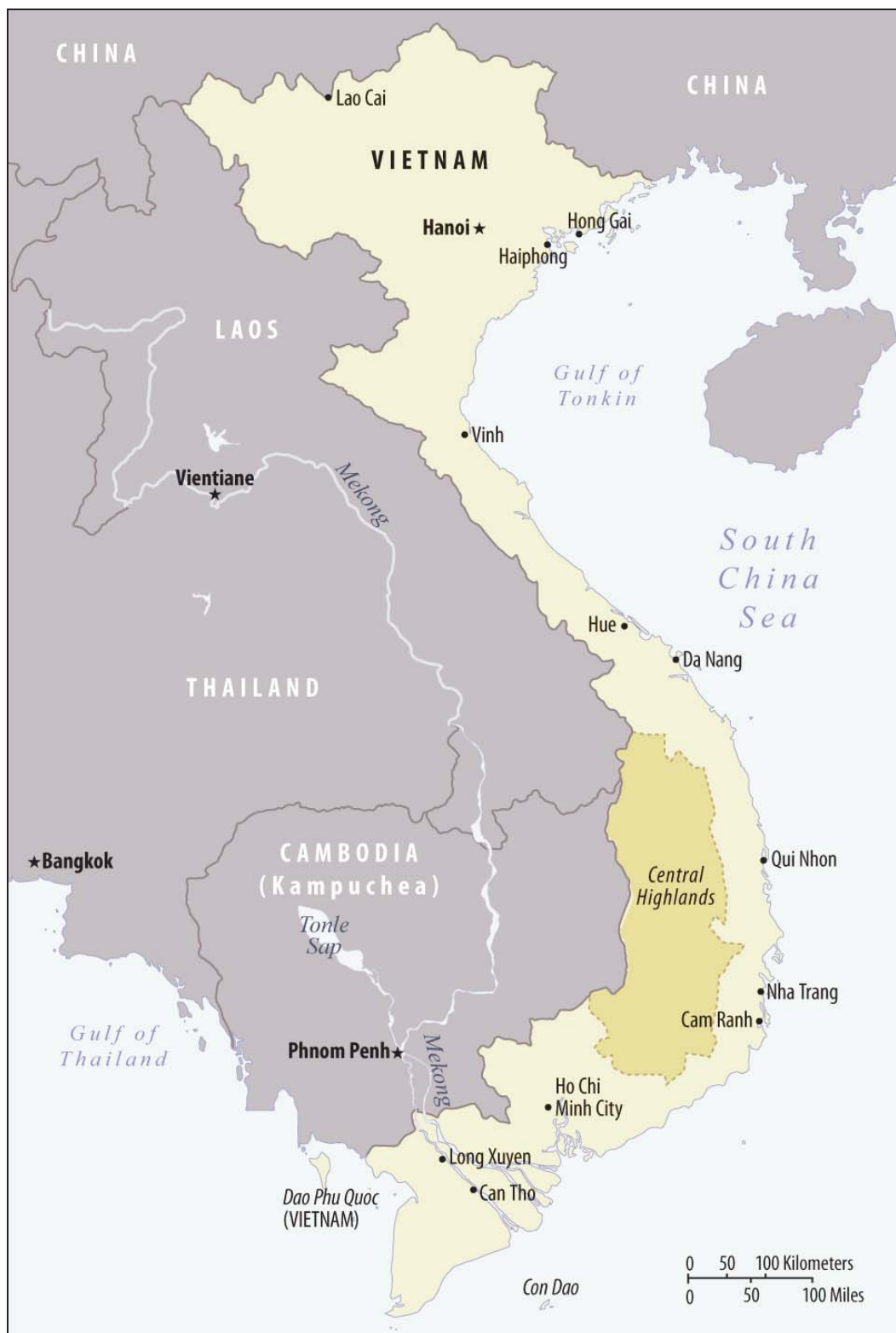
Figure 2. Map of Vietnam