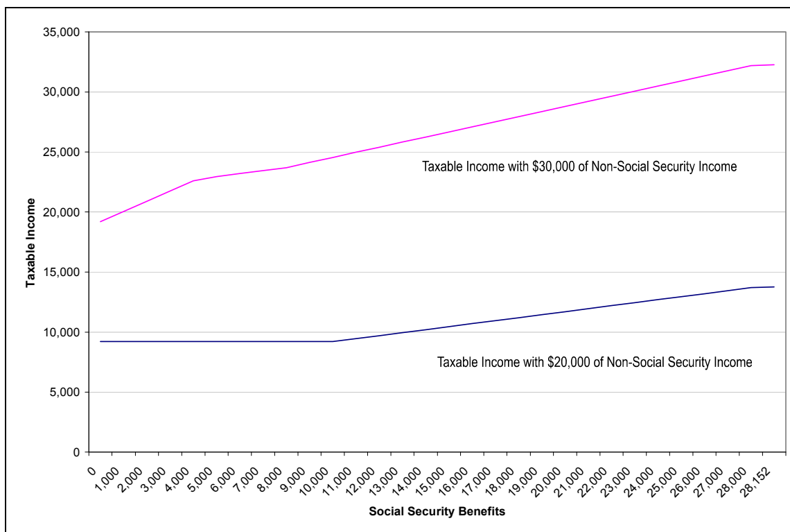
Figure 3. Taxable Income for a Single Retiree with $20,000 or $30,000 in Non-Social Security Income as Annual Social Security Benefits Increase, Tax Year 2010

Source: Figure prepared by the Congressional Research Service (CRS). Assumes Social Security benefits increase to $28,152—the maximum benefit in 2010 for a person retiring in 2010 at the age of 66.