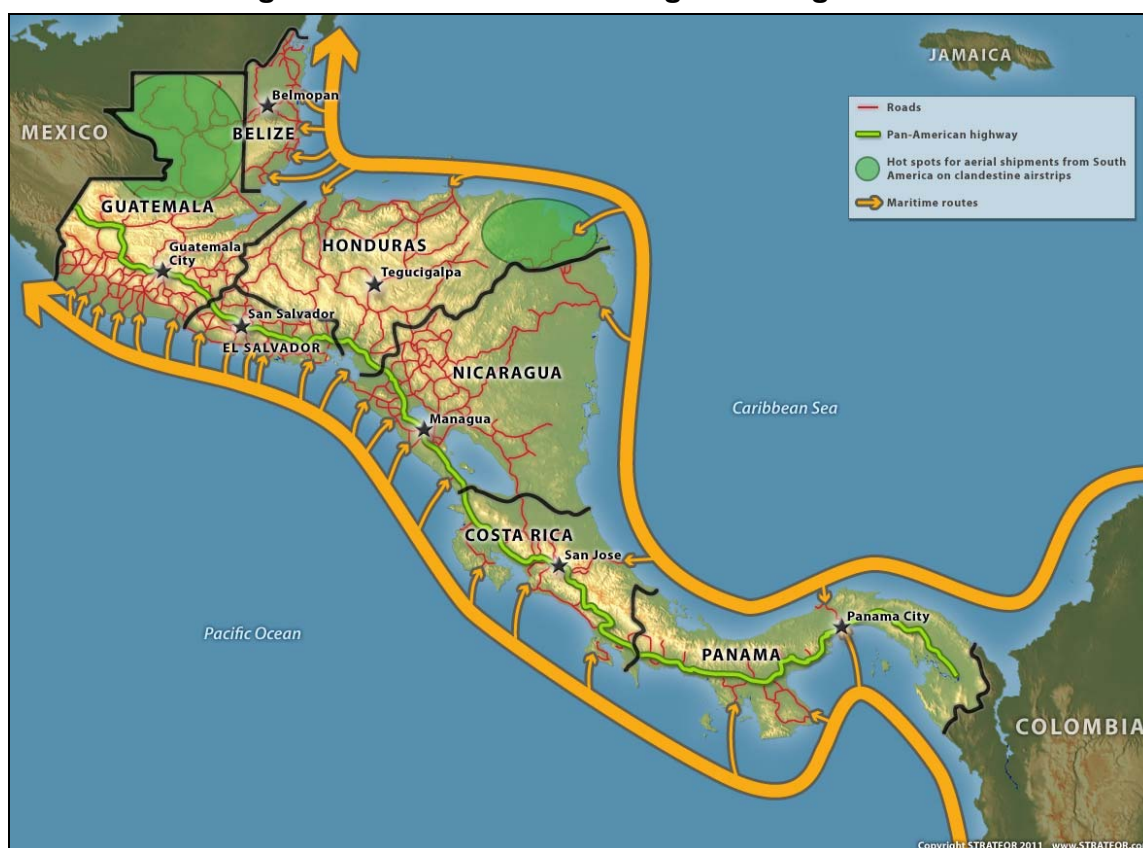
Figure 3. Central American Drug Trafficking Routes