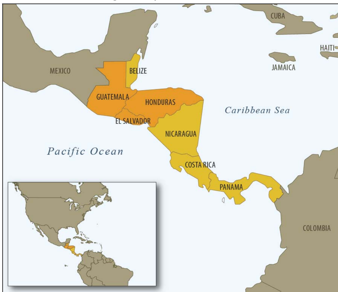
Figure 1. Map of Central America