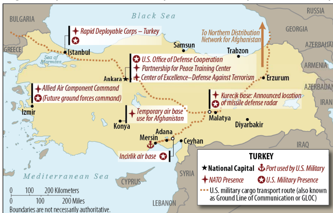
Figure 3. Map of U.S. and NATO Military Presence and Transport Routes in Turkey