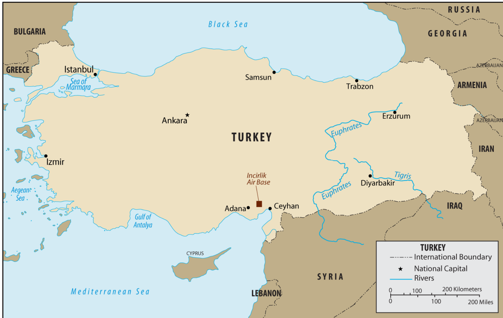
Figure 1. Turkey and Its Neighbors