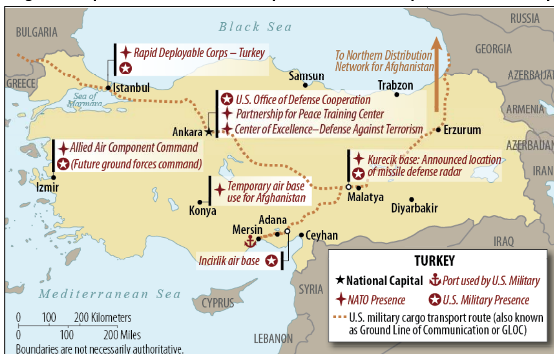
Figure 3. Map of U.S. and NATO Military Presence and Transport Routes in Turkey