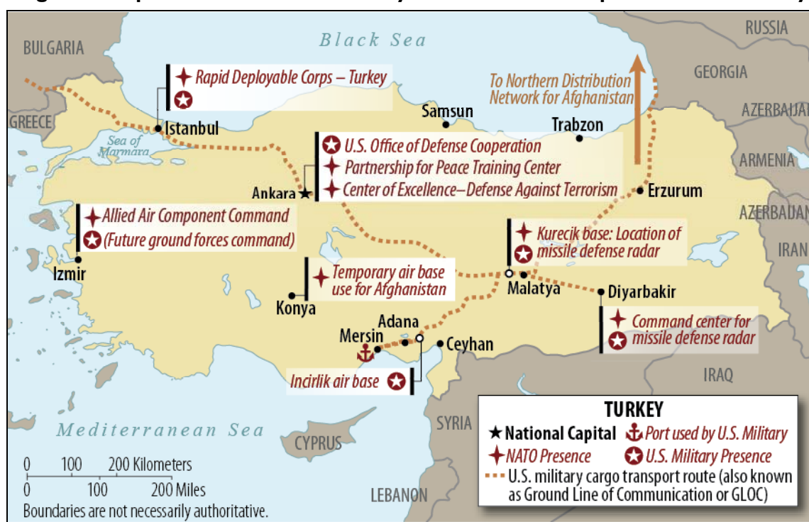
Figure 3. Map of U.S. and NATO Military Presence and Transport Routes in Turkey