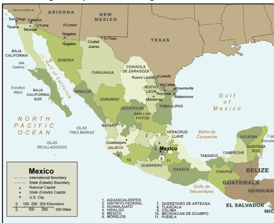
Figure 1. Map of Mexico, Including States and Border Cities

Over the past decade, Mexico has transitioned from a centralized political system dominated by the Institutional Revolutionary Party (PRI) to a multiparty democracy in which presidential power is increasingly constrained by Congress, the Supreme Court, and the country's governors. 1 President Felipe Calderón of the conservative National Action Party (PAN) won the July 2006 presidential election in an extremely tight race, defeating Andrés Manuel López Obrador of the leftist Party of the Democratic Revolution (PRD) by fewer than 234,000 votes. President Calderón began his six-year term on December 1, 2006. He is to be succeeded by Enrique Peña Nieto of the PRI, whom Mexico's Electoral Tribunal recently certified as the victor in Mexico's July 1, 2012, presidential elections. President-elect Peña Nieto is scheduled to take office on December 1, 2012.