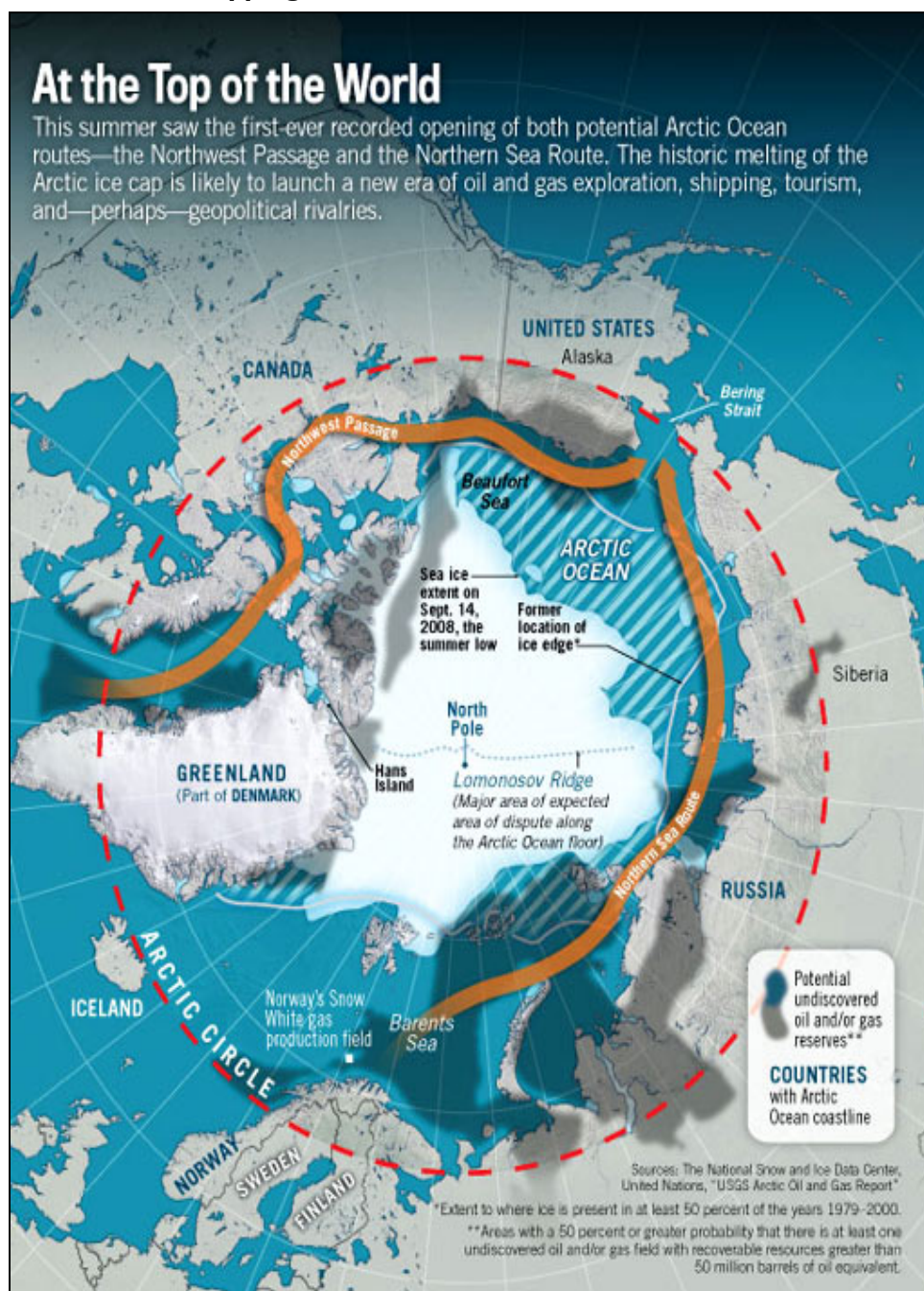
Figure 3. Arctic Sea Ice Extent in September 2008, Compared with Prospective Shipping Routes and Oil and Gas Resources