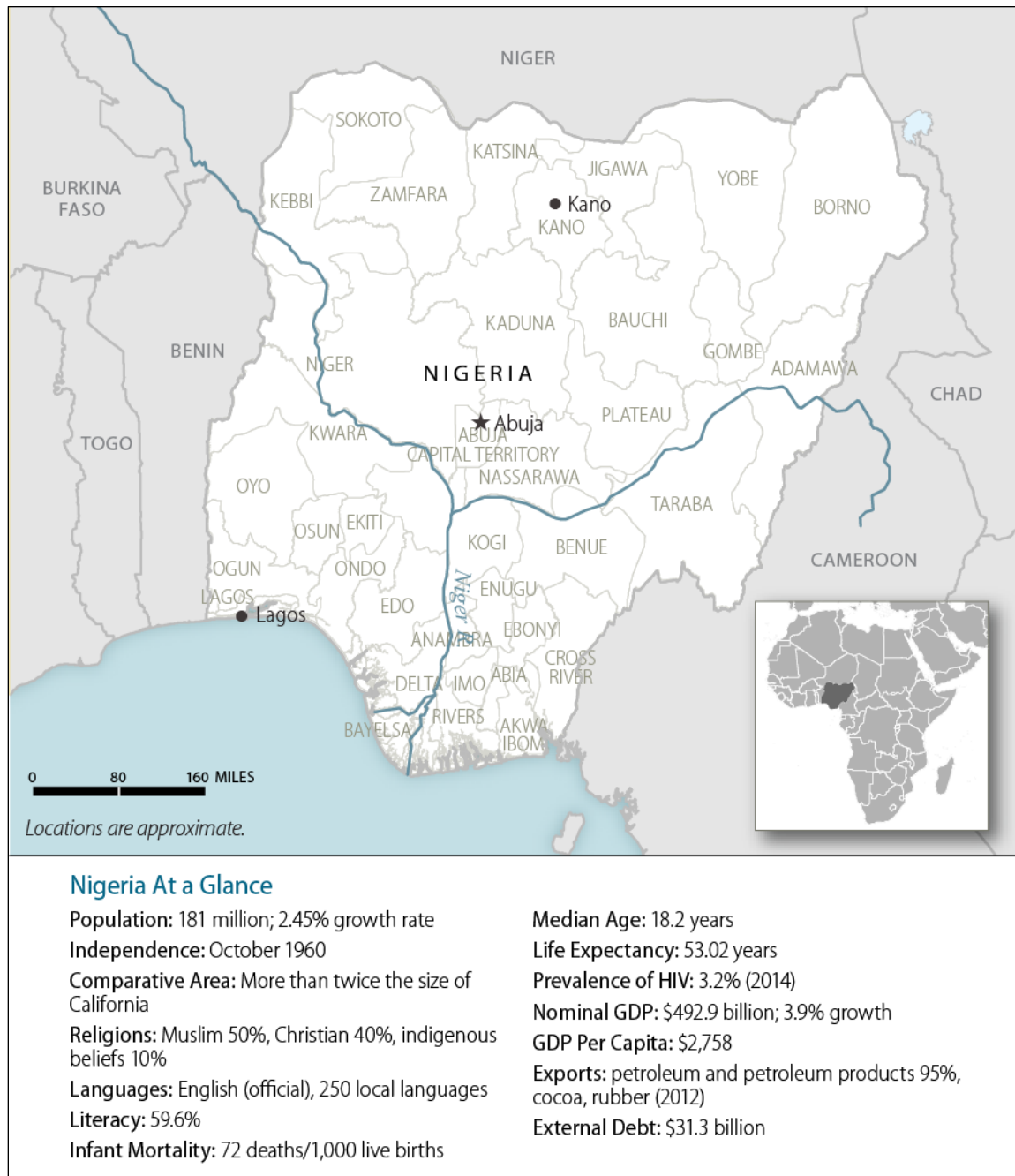
Figure I. Nigeria at a Glance

Source: CRS graphic. Map borders and cities generated using data from Department of State and Esri. Statistics from CIA World Factbook and the International Monetary Fund. 2015 estimates unless otherwise indicated.