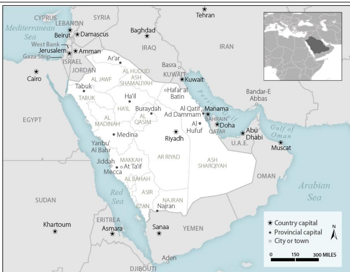
Table I. Saudi Arabia Map and Country Data

Land: Area, 2.15 million sq. km. (more than 20% the size of the United States); Boundaries, 4,431 km (~40% more than U.S.-Mexico border); Coastline, 2640 km (more than 25% longer than U.S. west coast)