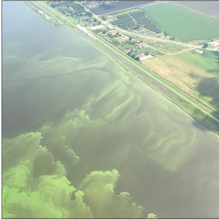
Figure 1. Aerial view of a July 2016 Harmful Algal Bloom in Lake Okeechobee, Florida