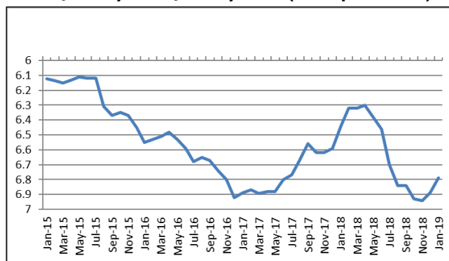
Figure 1. Average Monthly RMB-Dollar Reference Rates: January 2015-January 2019 (Yuan per Dollar)

The yuan-dollar exchange rate has experienced volatility over the past few years. On August 11, 2015, the Chinese central bank announced that the daily RMB central parity rate would become more "market-oriented." However, over the next three days, the RMB depreciated by 4.4% against the dollar and it continued to decline against the dollar throughout the rest of 2015 and into 2016. From August 2015 to December 2016 the RMB fell by 8.8% against the dollar. From January to December 2017, the RMB rose by 4.6% against the dollar. However, from January 2018 to December 2018, the RMB depreciated by 7.0%. Some analysts link the recent RMB depreciation to the trade conflict that has resulted from the U.S. imposition (and Chinese retaliation) of increased tariffs on $250 billion worth of imports from China in 2018 stemming from the Trump Administration's Section 301 investigation of China policies on intellectual property and innovation. They note that the trade conflict has negatively impacted U.S.-China commercial flows and China's economy (its real GDP growth dropped from 6.9% in 2017 to 6.6% in 2018 and is projected to slow to 6.2% in 2019), which may be pushing down the RMB's value. Others charge that China has intervened in currency markets to push down the RMB's value in order to offset the impact of U.S. tariff hikes.