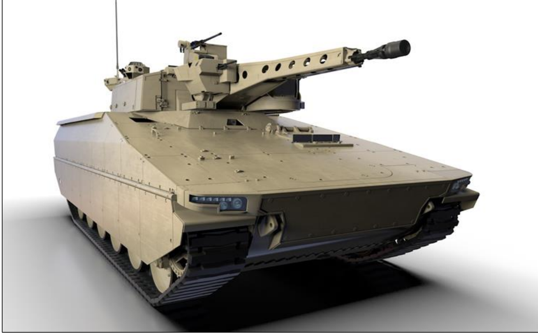
Figure 4. Raytheon/Rheinmetall Lynx Prototype