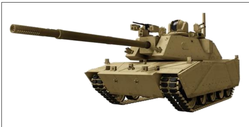
Figure 7. Illustrative RCV–H