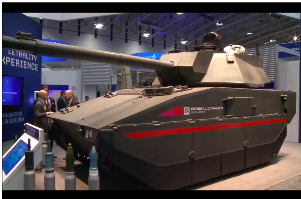
Figure 3. GDLS Griffin III Prototype