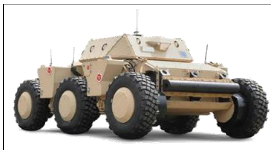
Figure 6. Illustrative RCV–M