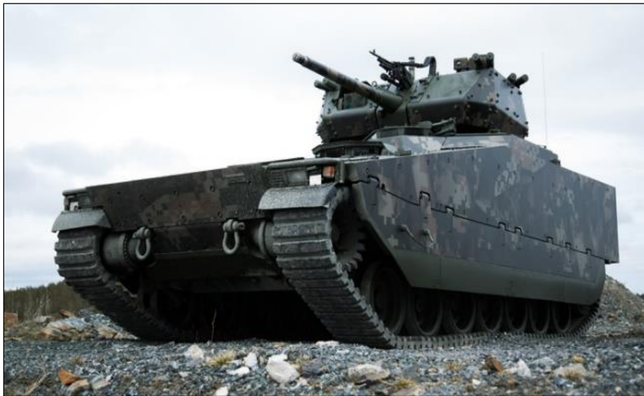
Figure 2. BAE Prototype CV-90