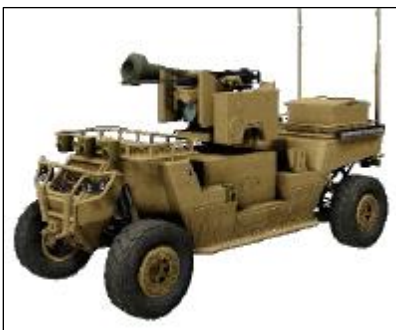
Figure 5. Illustrative RCV–L

Source: The Army's Robotic Combat Vehicle Campaign Plan, January 16, 2019.