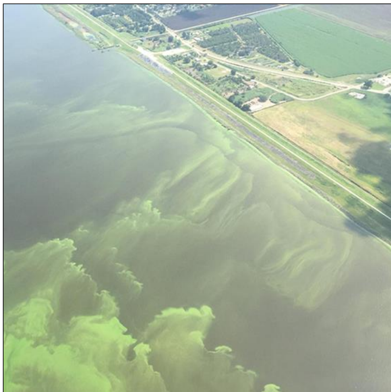
Figure 1. Aerial View of a July 2016 Harmful Algal Bloom in Lake Okeechobee, Florida