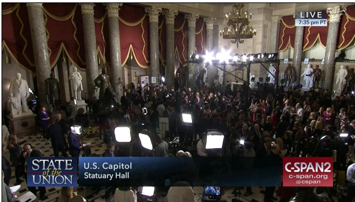
Figure 3. Media Interviews for State of the Union Address in National Statuary Hall January 30, 2018