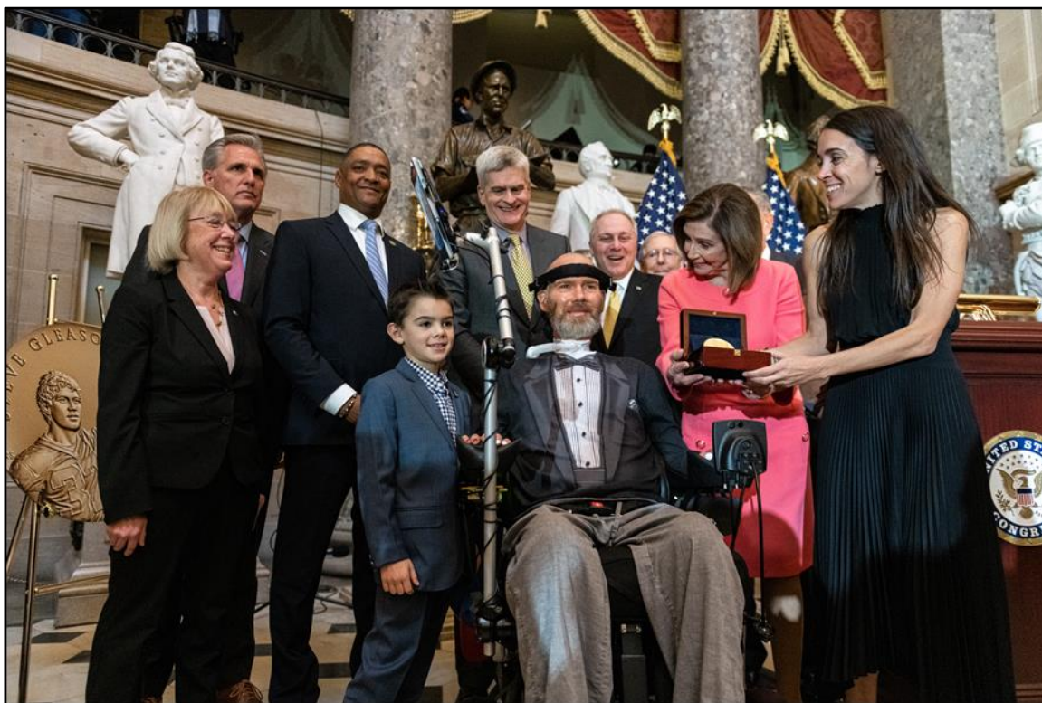
Figure 2. Congressional Gold Medal Presentation Ceremony for Stephen Gleason January 15, 2020