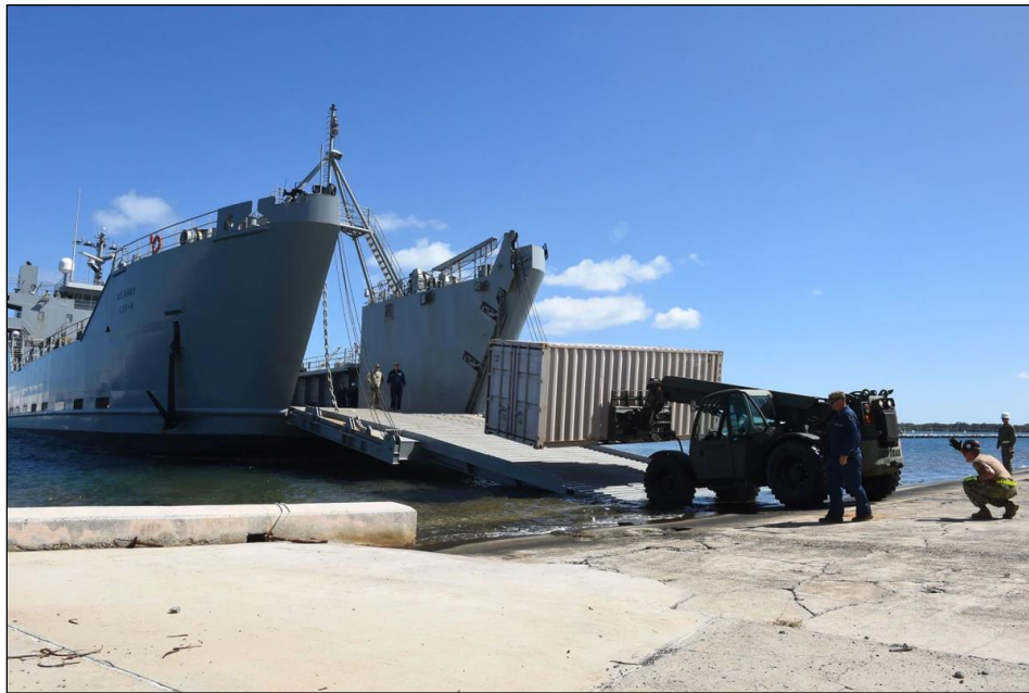
Figure 5. Besson-Class Logistics Support Vessel (LSV)

Source: Photograph accompanying Walker D. Mills and Joseph Hanacek, "The US Navy and Marine Corps Should Acquire Army Watercraft," Defense News , June 22, 2020. The caption to the photograph credits the photograph to the U.S. Navy and states: "U.S. Navy sailors conduct a simulated disaster relief supply offload from a General Frank S. Besson-class logistics support vessel at Joint Base Pearl Harbor-Hickam on July 10, 2016."