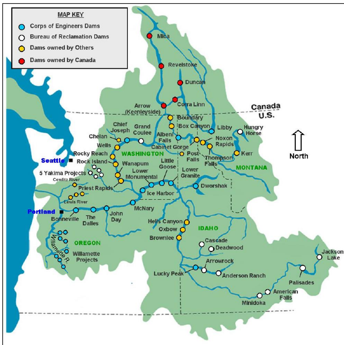
Figure 1. Columbia River Basin and Dams