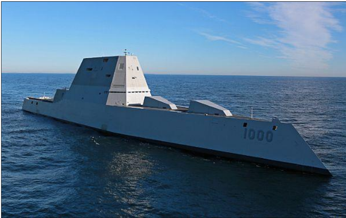
Figure A-1. DDG-1000 Class Destroyer

Source: U.S. Navy photo I51207-N-ZZ999-435, posted December 8, 2015, with a caption that reads in part: “The future USS Zumwalt (DDG 1000) is underway for the first time conducting at-sea tests and trials in the Atlantic Ocean Dec. 7, 2015.”