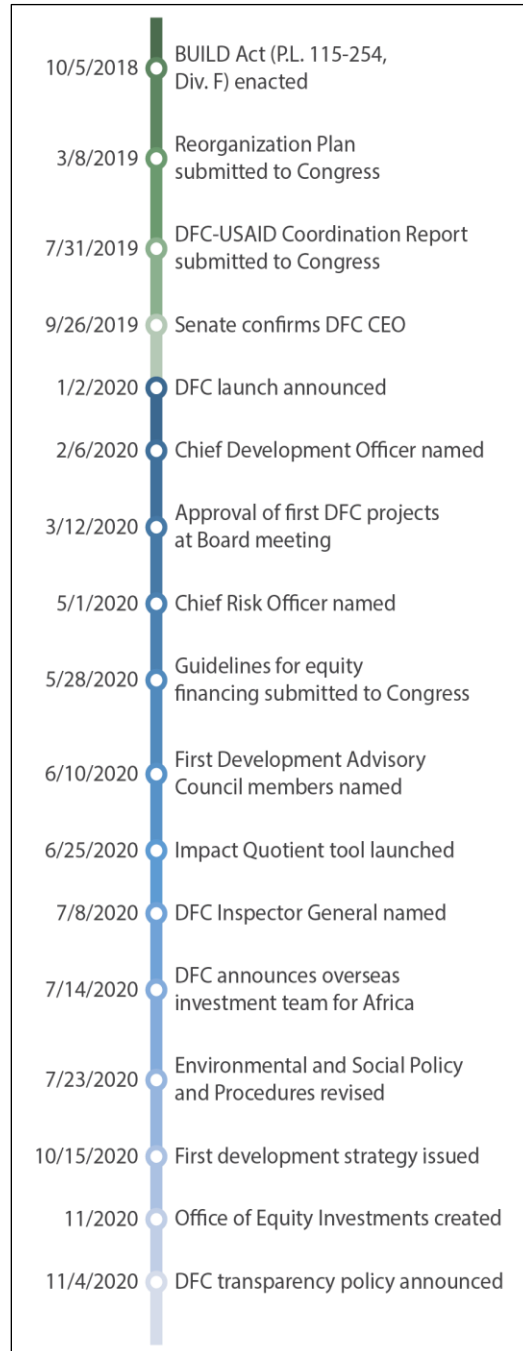
Figure 2. Milestones in DFC Mobilization