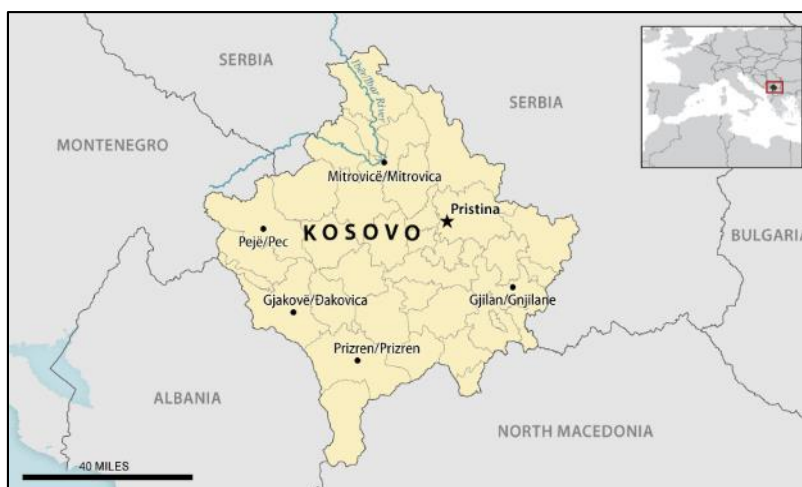
Figure 1. Republic of Kosovo

Kosovo is a parliamentary democracy with a prime minister, who serves as head of government, and an indirectly elected president, who serves as head of state. The unicameral National Assembly has 120 seats, of which 10 are reserved for Serbs and 10 are reserved for other minorities. Avdullah Hoti is acting prime minister. Prime Minister-designate Albin Kurti (the longtime leader of Vetëvendosje) is poised to form the next government, just one year after his first short-lived government collapsed. Parliamentary Speaker Vjosa Osmani became acting president in November 2020, when then-President Hashim Thaçi resigned (see “Transitional Justice,” below).