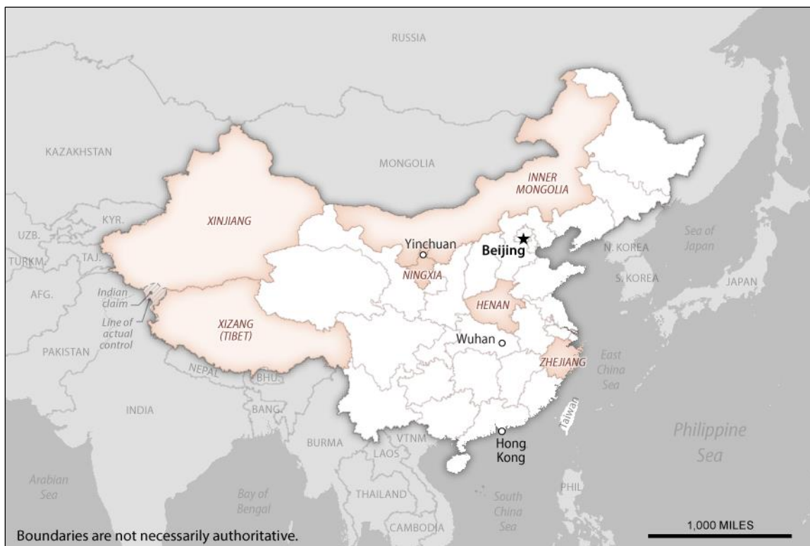
Figure 1. Map of China: Selected Places of Notable Reported Human Rights Issues