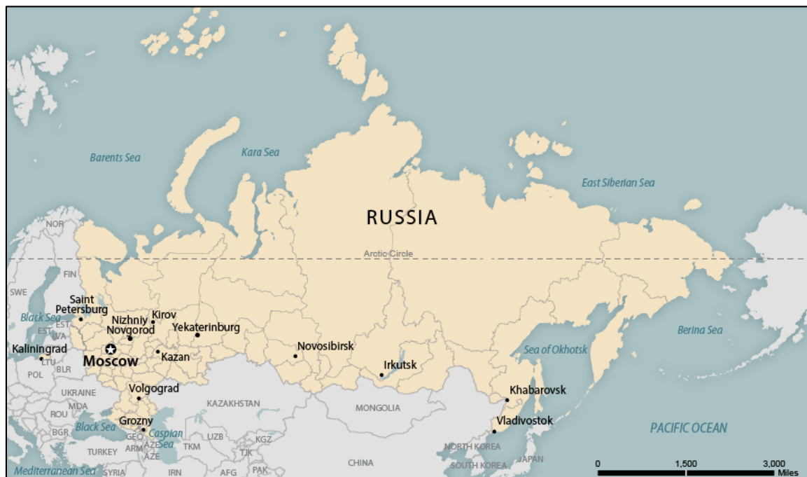
Figure I. Russian Federation