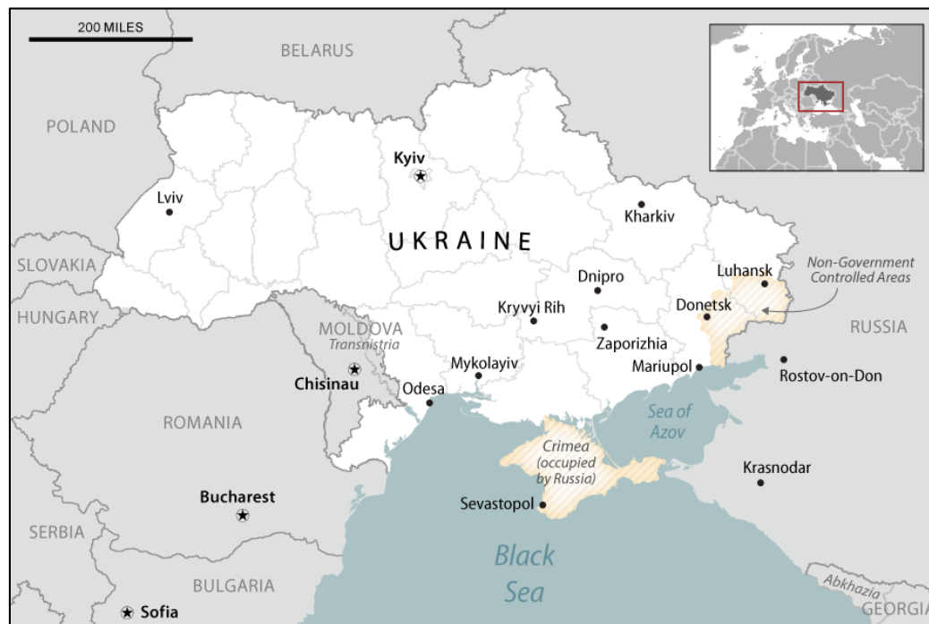
Figure 2. Ukraine