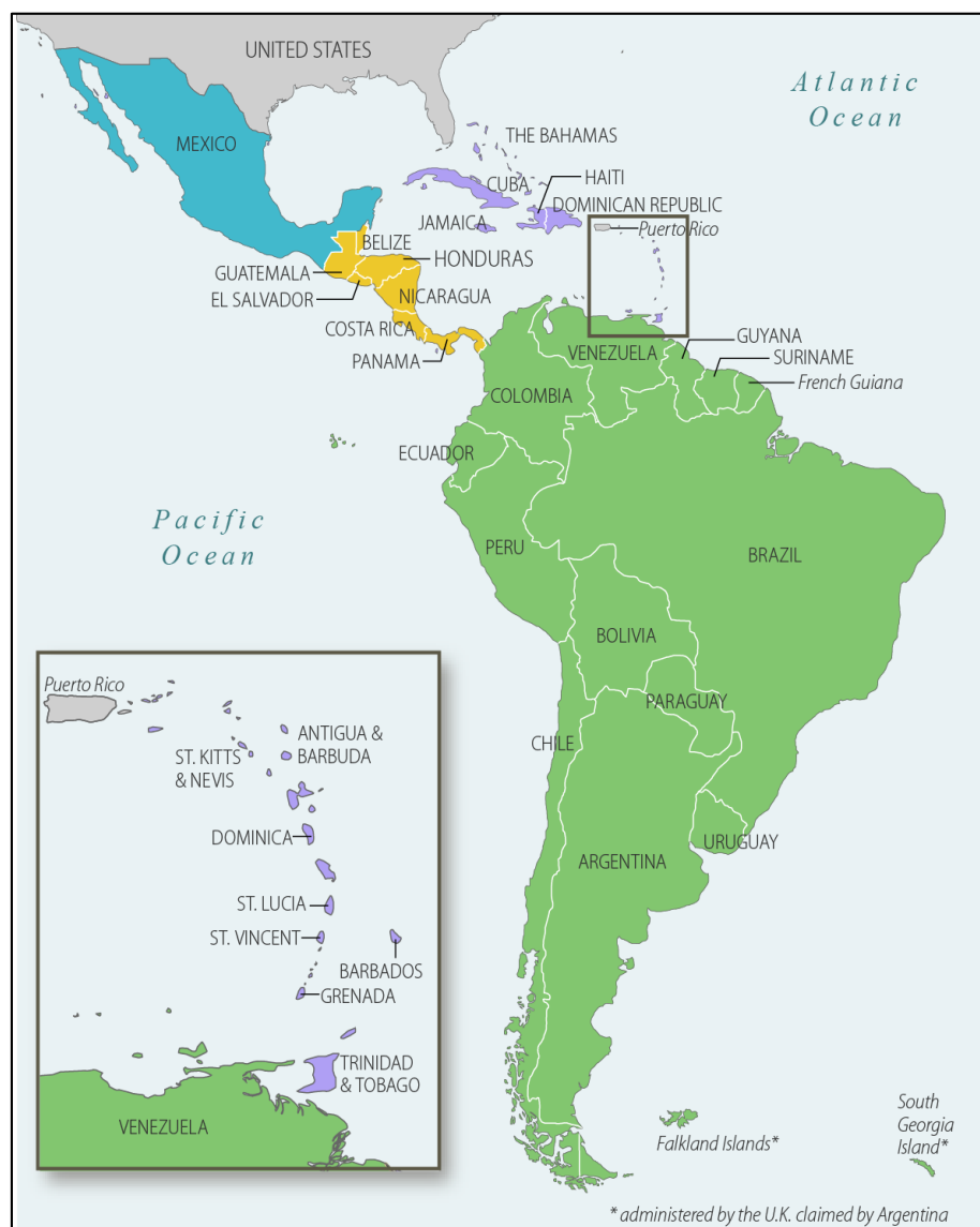
Figure 1. Map of Latin America and the Caribbean