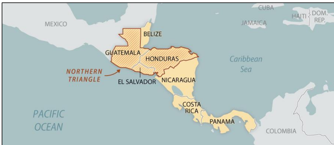
Figure 3. Map of Central America

In Honduras, for example, the number of beneficiaries of USAID programs fell from 1.5 million in March 2019 to 640,000 in January 2021. 122