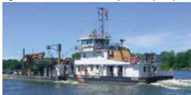
Figure 1. Coast Guard River Buoy Tender (WLR)

As of 2019, the 13 WLICs were based at cities along the U.S. East and Gulf coasts in Alabama, Florida (three cutters), Louisiana (two cutters), Maryland, North Carolina, South Carolina, Texas (three cutters), and Virginia. As of 2019, the four WLIs were based at locations in Alaska, Michigan, Oregon, and North Carolina.