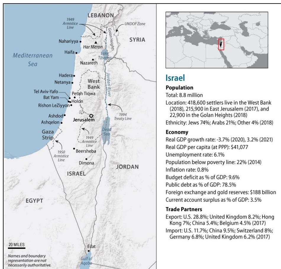
Figure 1. Israel: Map and Basic Facts

Sources: Graphic created by CRS. Map boundaries and information generated by Hannah Fischer using Department of State Boundaries (2017); Esri (2013); the National Geospatial-Intelligence Agency GeoNames Database (2015); DeLorme (2014). Fact information from CIA, The World Factbook ; and Economist Intelligence Unit. All numbers are forecasts for 2021 unless otherwise specified.