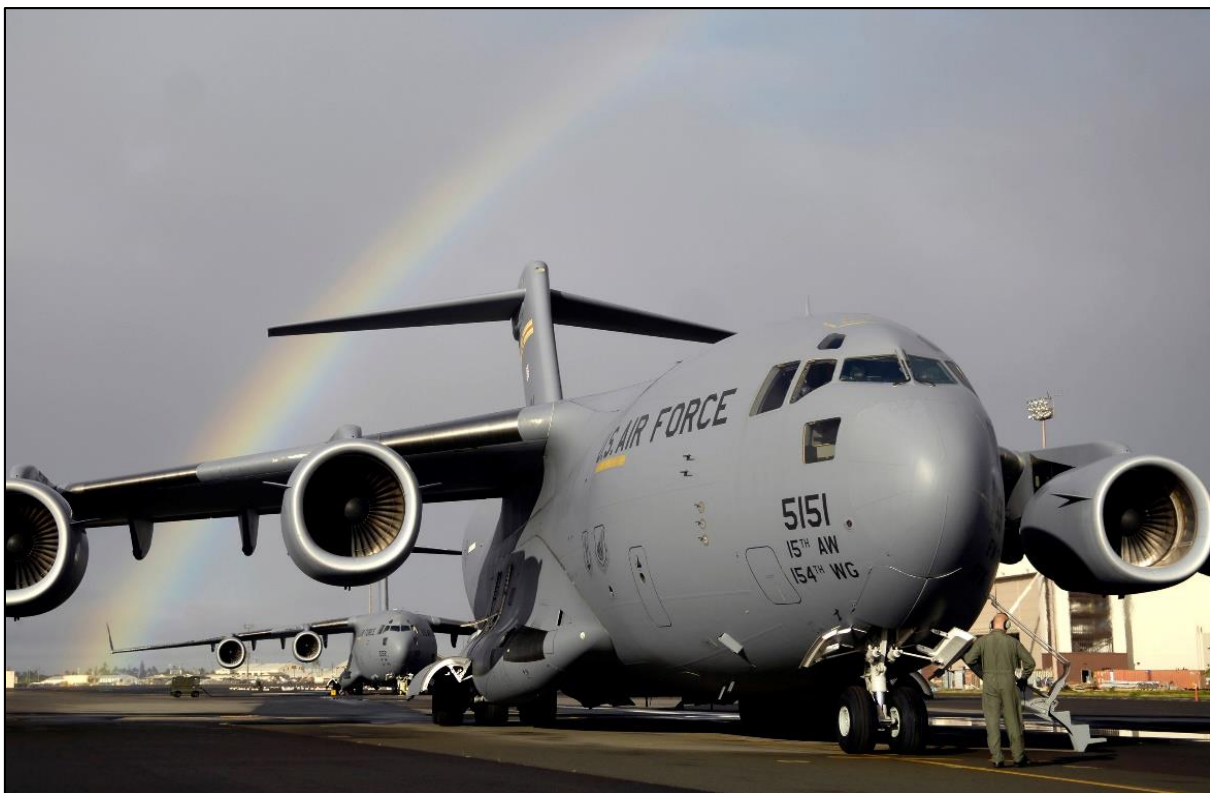
Figure 2. U.S. C-17 Aircraft