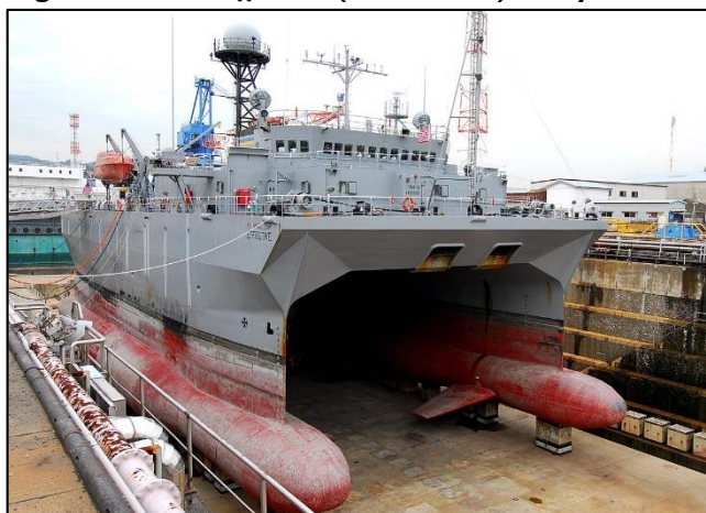
Figure 2. USNS Effective (TAGOS-21) in Dry Dock