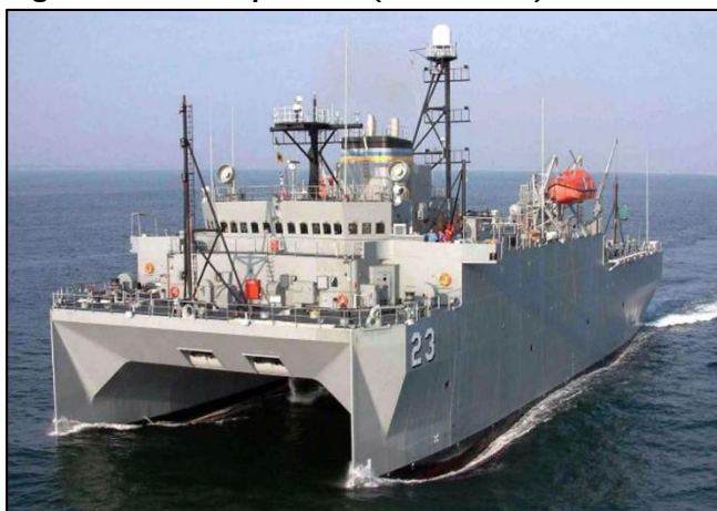
Figure 1. USNS Impeccable (TAGOS-23)