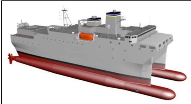
Figure 4. Notional Navy Design for TAGOS(X)