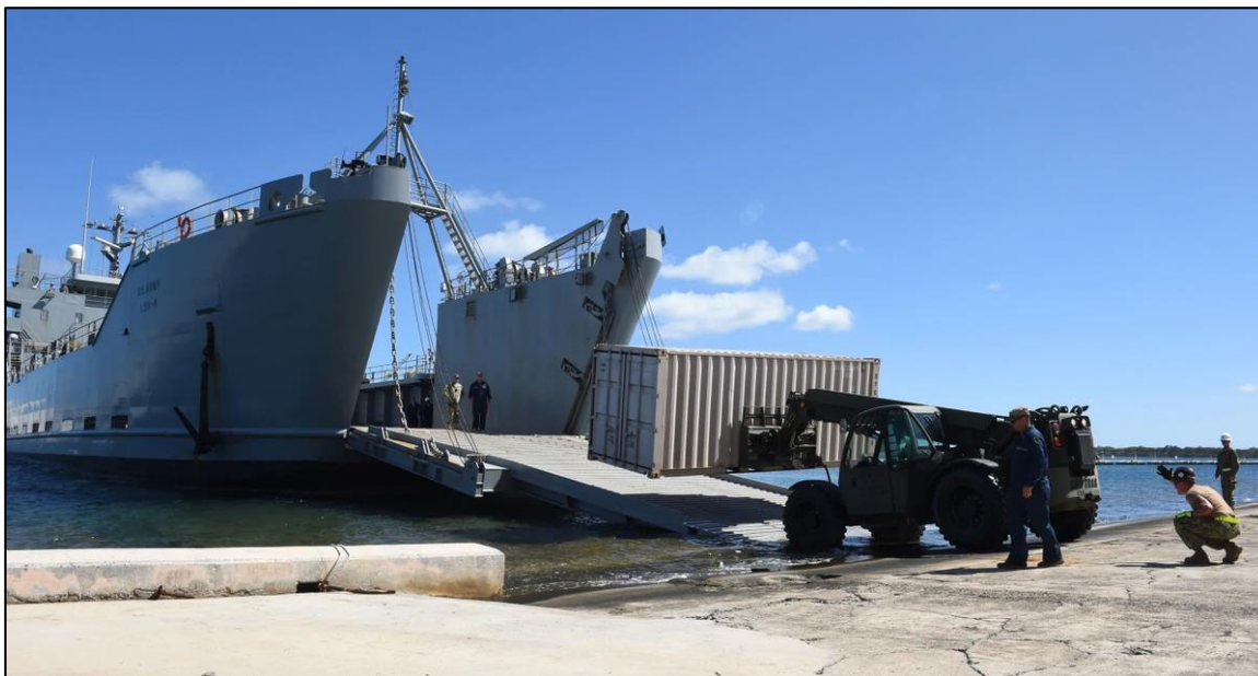
Figure 4. Besson-Class Logistics Support Vessel (LSV)

Source: Cropped version of photograph accompanying Walker D. Mills and Joseph Hanacek, "The US Navy and Marine Corps Should Acquire Army Watercraft," Defense News , June 22, 2020. The caption to the photograph credits the photograph to the U.S. Navy and states, "U.S. Navy sailors conduct a simulated disaster relief supply offload from a General Frank S. Besson-class logistics support vessel at Joint Base Pearl Harbor-Hickam on July 10, 2016."