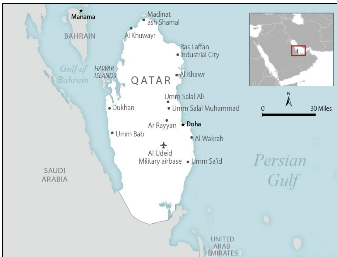
Figure I. Qatar at-a-Glance