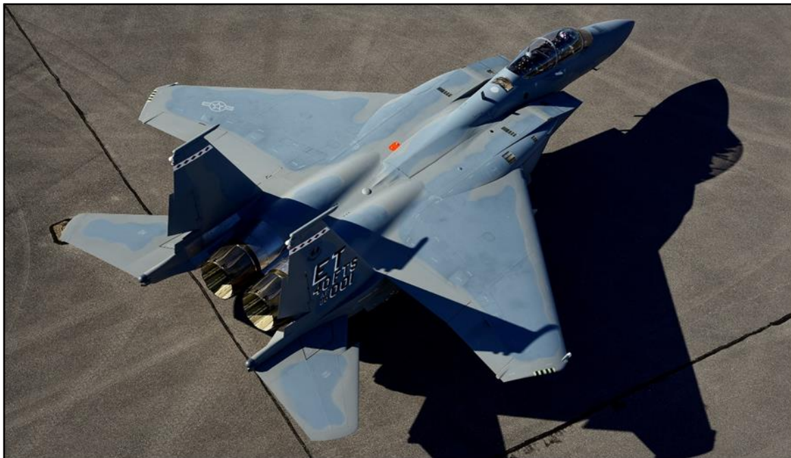
Figure 1. F-15EX Eagle II First delivery to the U.S. Air Force