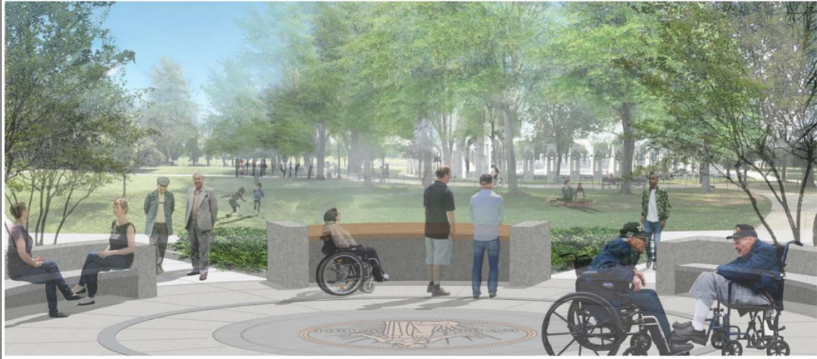
Figure 2. World War II D-Day Prayer Plaque Proposed Design and Location

Source: Friends of the National World War II Memorial, Inc, “Revised Circle and Prayer Plaque Design: View to WWII Memorial,” Presentation to the Commission of Fine Arts , April 15, 2021, 2017, p. 14, at https://www.cfa.gov/system/files/meeting-materials/1-CFA-15APR21-1-WWII_Prayer_Plaque_REVISED-pres.pdf#page=14 .