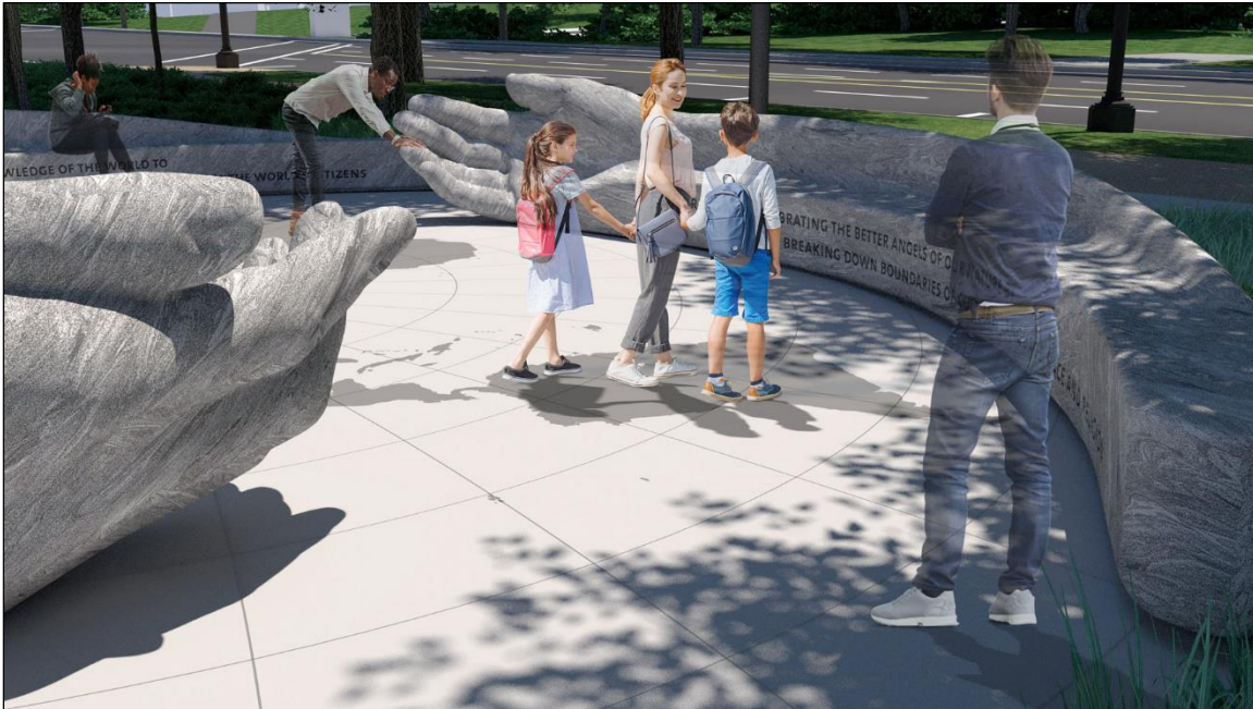
Figure 6. Peace Corps Memorial Concept Design