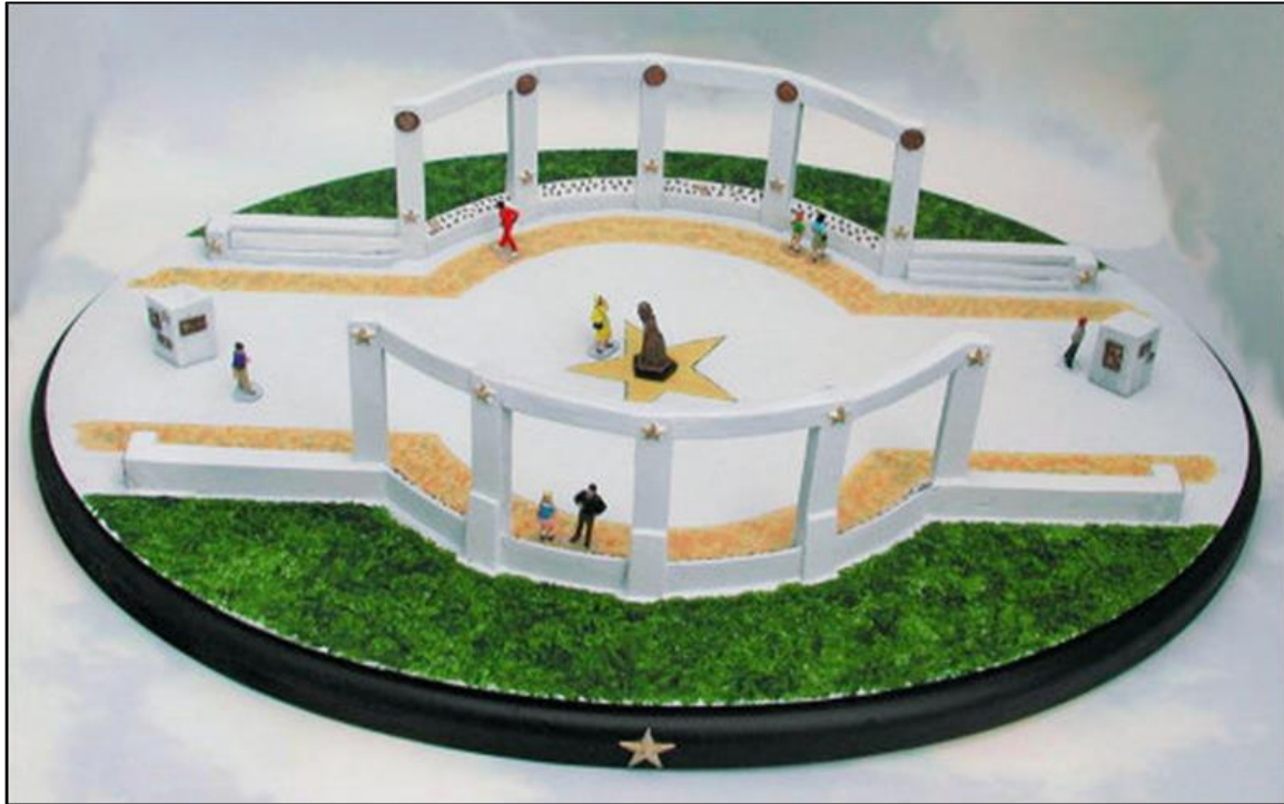
Figure 8. Gold Star Mothers Memorial Concept Design