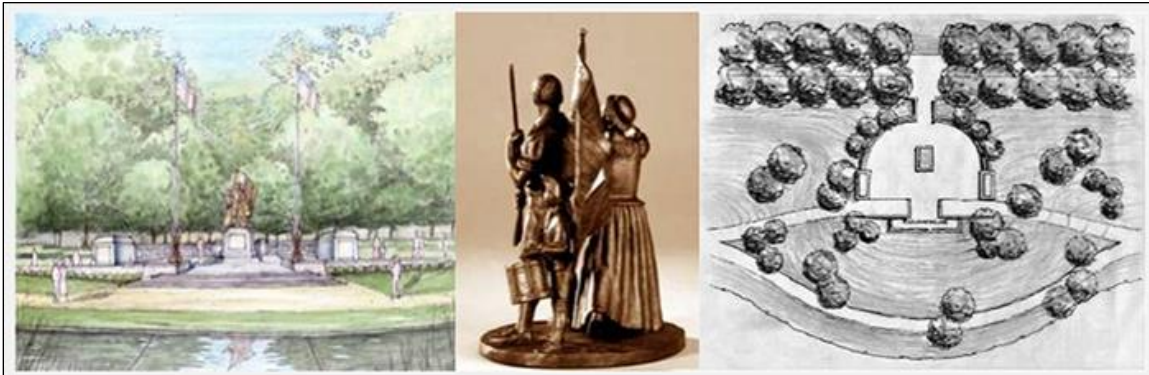
Figure 3. Slaves and Free Black Persons Who Served in the Revolutionary War Concept Design

Source: Liberty Mall Fund DC, “Conceptual Design—National Liberty Memorial,” National Liberty Memorial Site Selection Report , presentation to the National Capital Memorial Advisory Commission, July 23, 2013, at http://libertyfunddc.com/wp-content/uploads/2015/01/PRINTED-VERSION-National-Liberty-Memorial-Site-Selection-Report-SITE-NC....pdf .