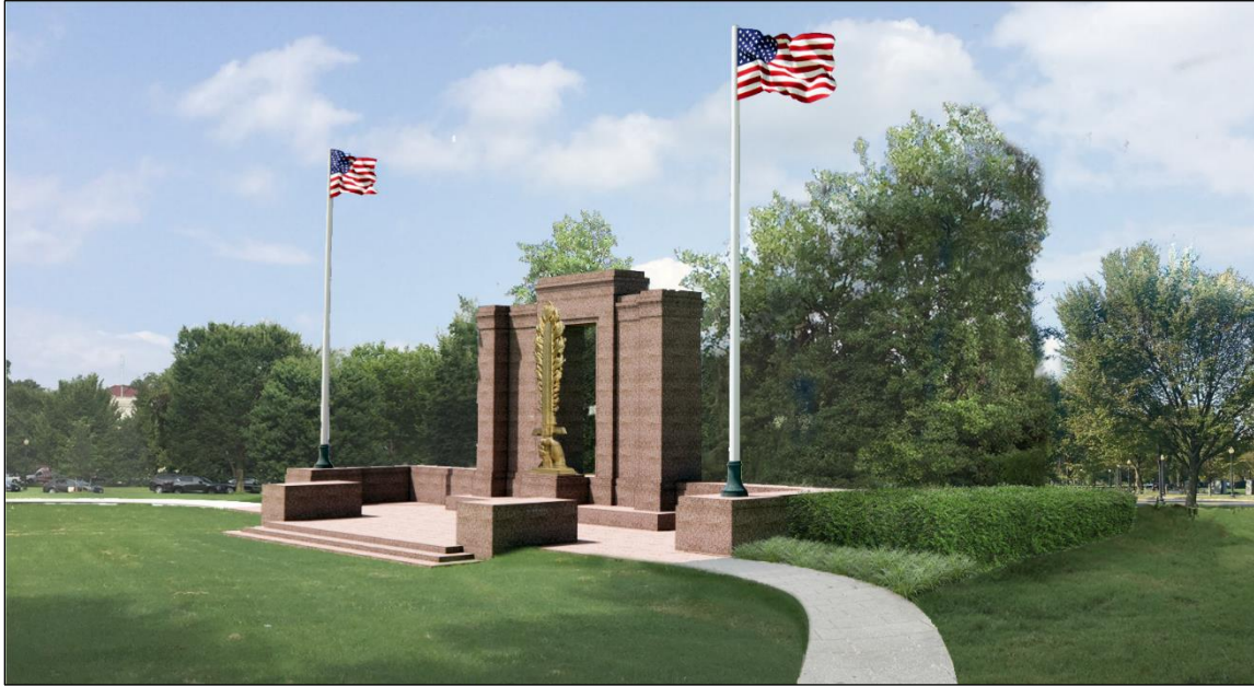
Figure 4. Second Division Memorial

Source: Second Infantry Division Association Memorial Foundation, “Second Infantry Division Memorial Modification,” CFA Submission, November 19, 2020, p. 21, at https://www.cfa.gov/system/files/meeting-materials/CFA-19NOV20-2-Second_Division_Memorial_%28pres%29.pdf .