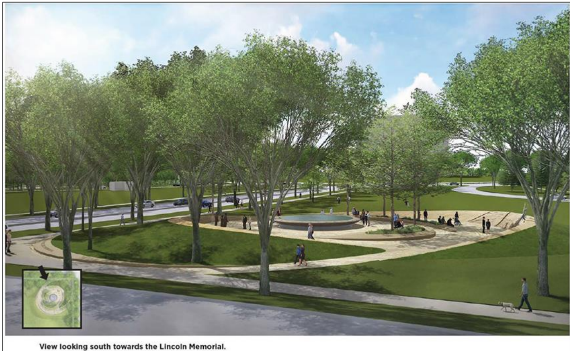
View looking south towards the Lincoln Memorial.

Source: National Capital Planning Commission, "National Desert Storm and Desert Shield Memorial: Executive Director's Recommendation," NCPC File Number: 7745, p. 26, at https://www.ncpc.gov/docs/actions/2020January/7745_National_Desert_Storm_and_Desert_Shield_Memorial_Staff_Report_Jan2020.pdf .