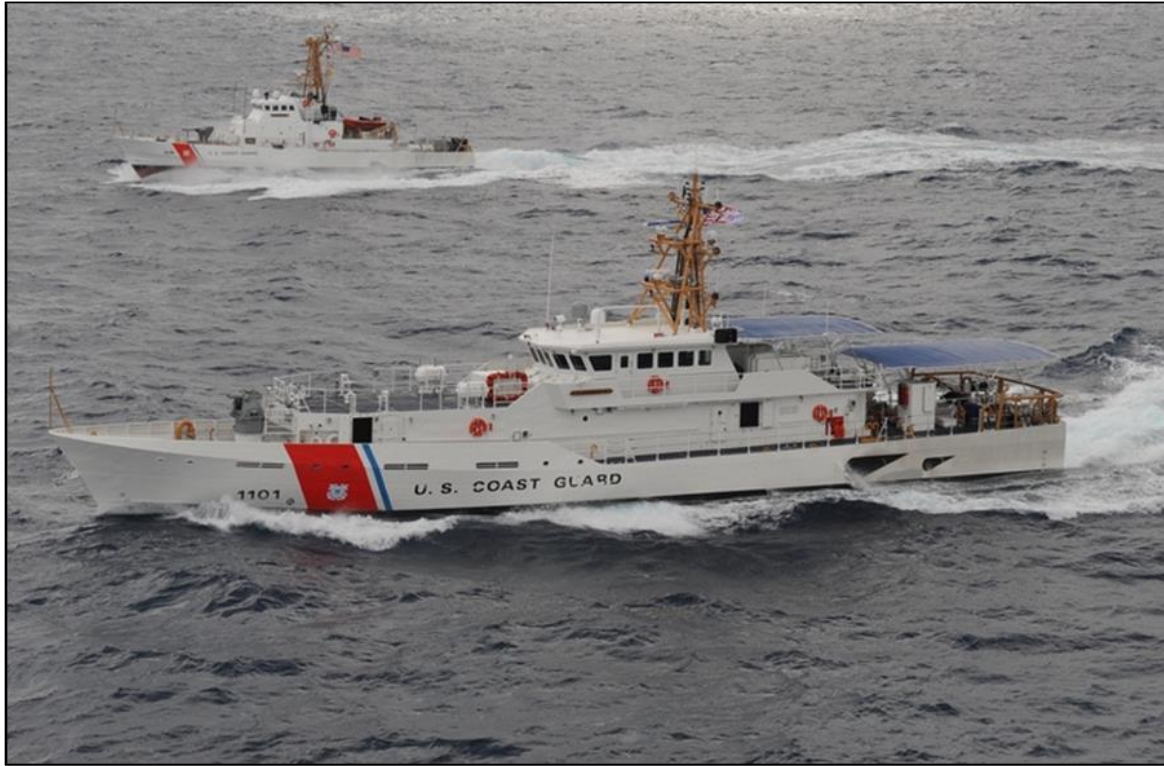
Figure 8. Fast Response Cutter With an older Island-class patrol boat behind