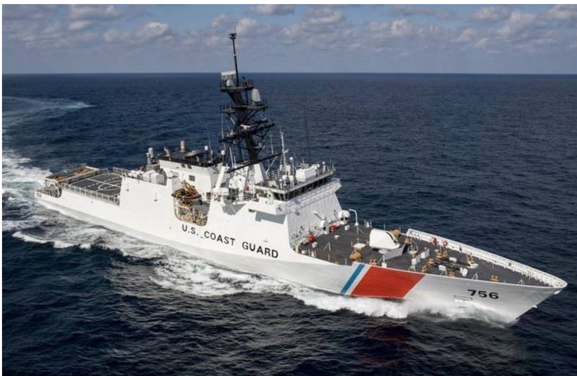
Figure 1. National Security Cutter