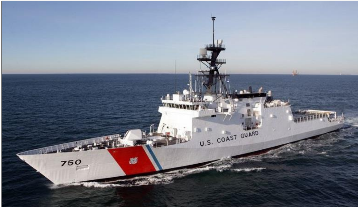
Figure 2. National Security Cutter