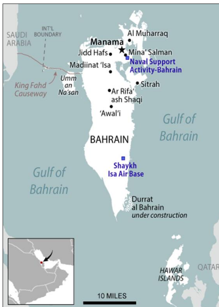
Figure 3. Bahrain