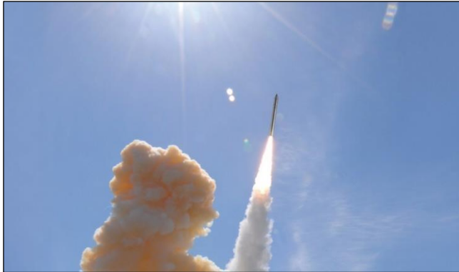
Figure 1. Notional GBSD Launch