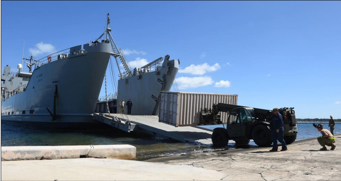
Figure 4. Besson-Class Logistics Support Vessel (LSV)

Source: Cropped version of photograph accompanying Walker D. Mills and Joseph Hanacek, “The US Navy and Marine Corps Should Acquire Army Watercraft,” Defense News , June 22, 2020. The caption to the photograph credits the photograph to the U.S. Navy and states, “U.S. Navy sailors conduct a simulated disaster relief supply offload from a General Frank S. Besson-class logistics support vessel at Joint Base Pearl Harbor-Hickam on July 10, 2016.”