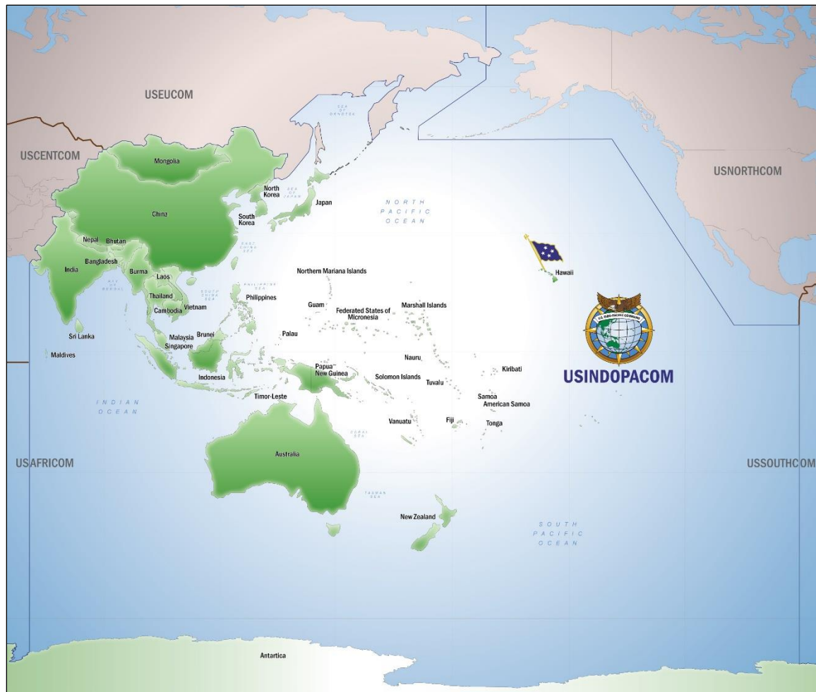
Figure I. USINDOPACOM Area of Responsibility