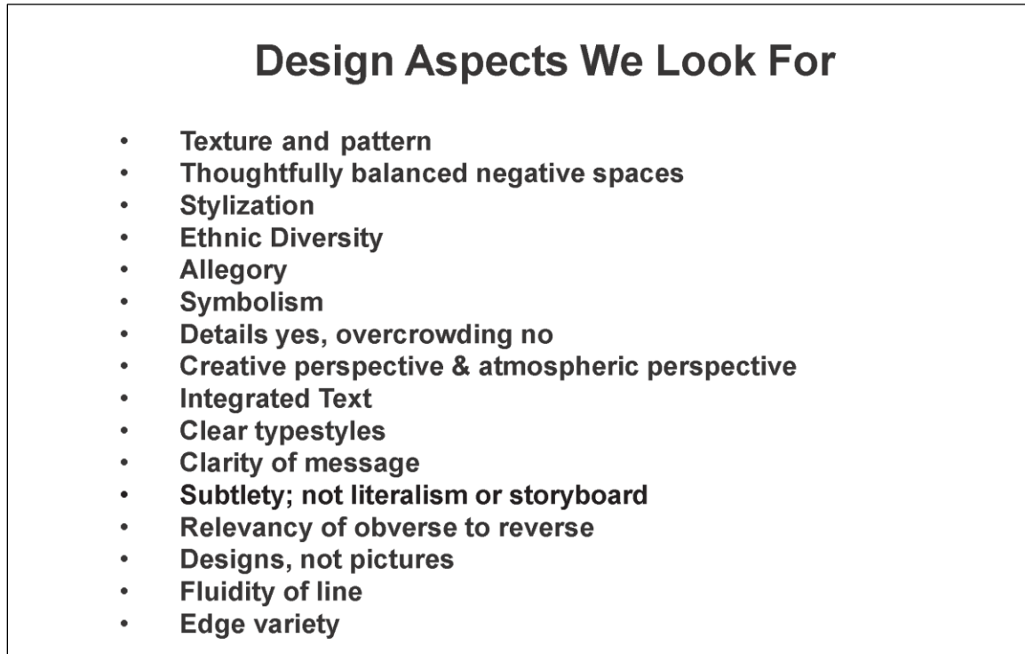
Figure 1. Citizens Coinage Advisory Committee Design Elements