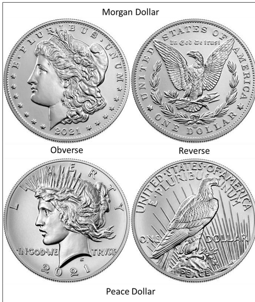
Figure 4. 2021 Morgan and Peace Dollar Designs