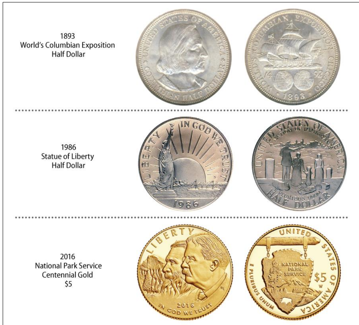
Figure 2. Examples of Commemorative Coin Designs

Sources: “Columbian Exposition Half Dollar,” Early Commemorative Coins , at http://earlycommemorativecoins.com/1892-columbian-half-dollar ; U.S. Department of the Treasury, U.S. Mint, “1986 Statue of Liberty Half Dollar,” at https://www.usmint.gov/about_the_mint/CoinLibrary/index.cfm#statueLib ; and U.S. Department of the Treasury, U.S. Mint, “2016 National Park Service 100 th Anniversary Commemorative Coin Program: Gold Obverse and Reverse,” at https://www.usmint.gov/coins/coin-medal-programs/commemorative-coins/national-park-service-100th-anniversary-gold .