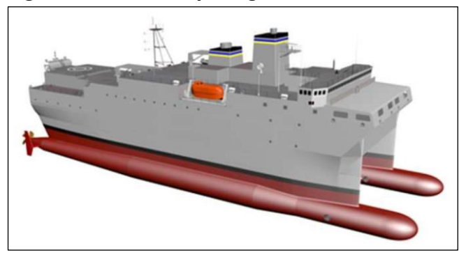
Source: Artist's rendering accompanying press released entitled "Halter Marine Secures Contract for Industrial Studies for T-AGOS Program," Halter Marine, July 20, 2020.