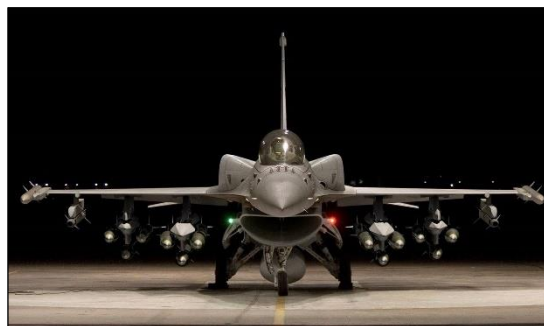
Figure 1. F-16 Block 70/72 Viper

The F-16 proposal takes place within a context of complicated U.S.-Turkey relations, and at a time when a number of U.S. allies and traditional partners are evaluating their strategic options in an era of global great-power competition. 4 Since Turkey joined NATO in 1952, the United States and Turkey have cooperated closely on some issues and differed sharply on others. 5 A March