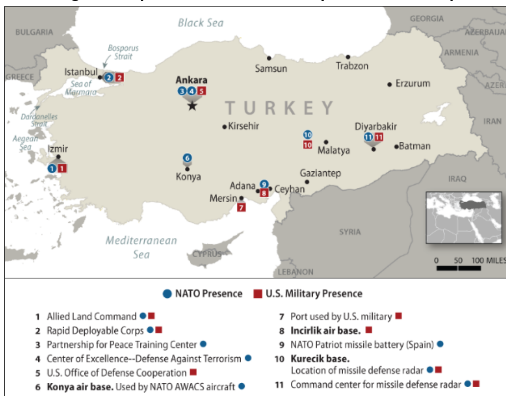
Figure 3. Map of U.S. and NATO Military Presence in Turkey