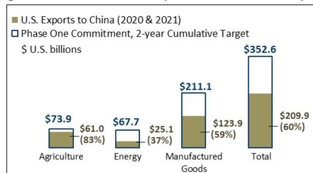
Figure 2. Phase One Trade (Jan. 2020 to Dec. 2021)