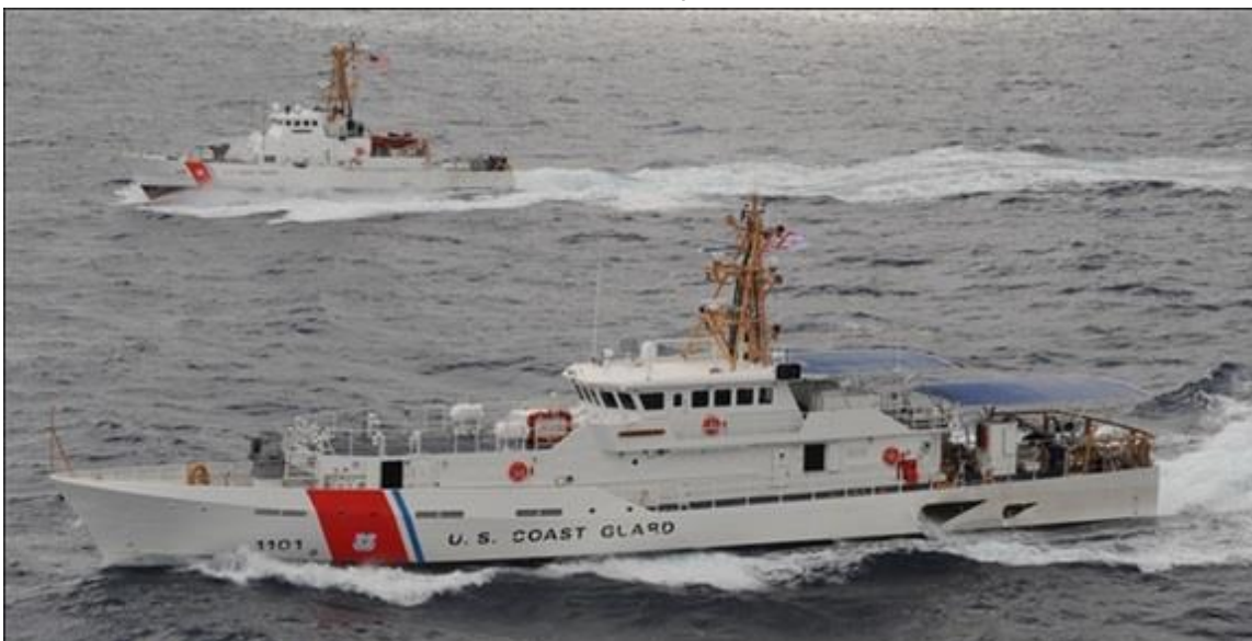
Figure 10. Fast Response Cutter With an older Island-class patrol boat behind