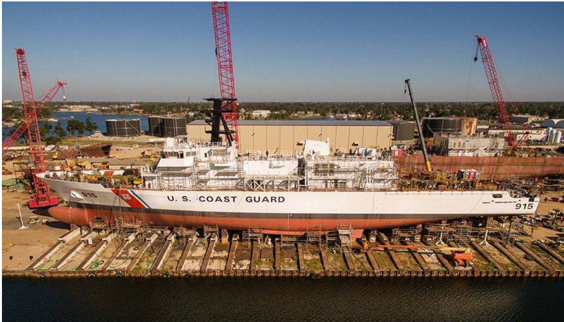
Figure 7. First Offshore Patrol Cutter Under Construction