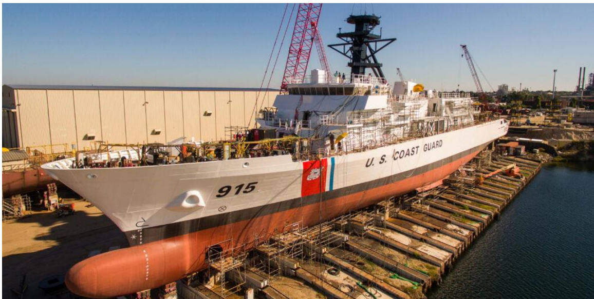
Figure 8. First Offshore Patrol Cutter Under Construction