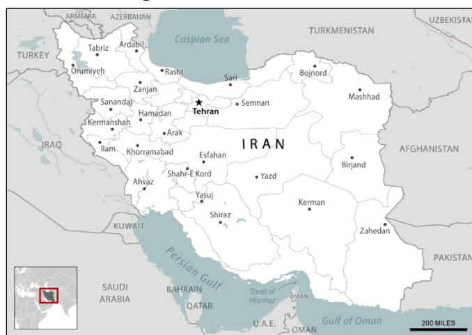
Figure 1. Iran at a Glance

The Islamic Republic of Iran, the second-largest country in the Middle East by size (after Saudi Arabia) and population (after Egypt), has for decades played an assertive, and by many accounts destabilizing, role in the region and beyond. Iran's influence stems from its oil reserves (the world's fourth largest), its status as the world's most populous Shia Muslim country, and its active support for political and armed groups (including several U.S.-designated terrorist organizations) throughout the Middle East. Attacks by those groups against Israel, U.S. forces, and other targets in the region have increased in late 2023 and early 2024.