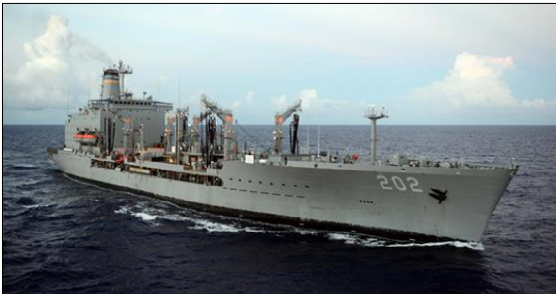
Figure 4. Kaiser (TAO-I87) Class Fleet Oiler

(The oilers shown in Figure 1 , Figure 2 , and Figure 3 are also Kaiser-class class oilers.)