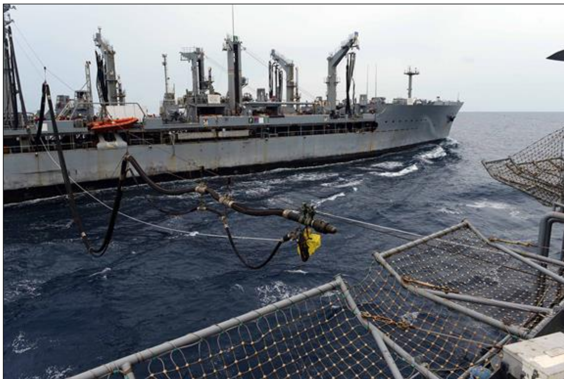
Figure 1. Fleet Oiler Conducting an UNREP

The Navy states that the photo is dated October 24, 2013, and shows the oiler Tippecanoe (TAO-199) extending its fuel probe to the Aegis cruiser USS Antietam (CG-54), a part of the George Washington (CVN-73) Carrier Strike Group, in the South China Sea.