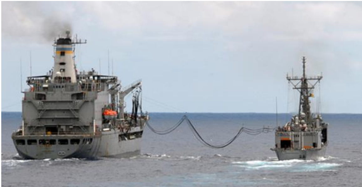
Figure 2. Fleet Oiler Conducting an UNREP

The Navy states that the photo is dated July 13, 2008, and shows the oiler Leroy Grumman (TAO-195) refueling the frigate Underwood (FFG-36) during an exercise with the Iwo Jima (LHD-7) Expeditionary Strike Group in the Atlantic Ocean.