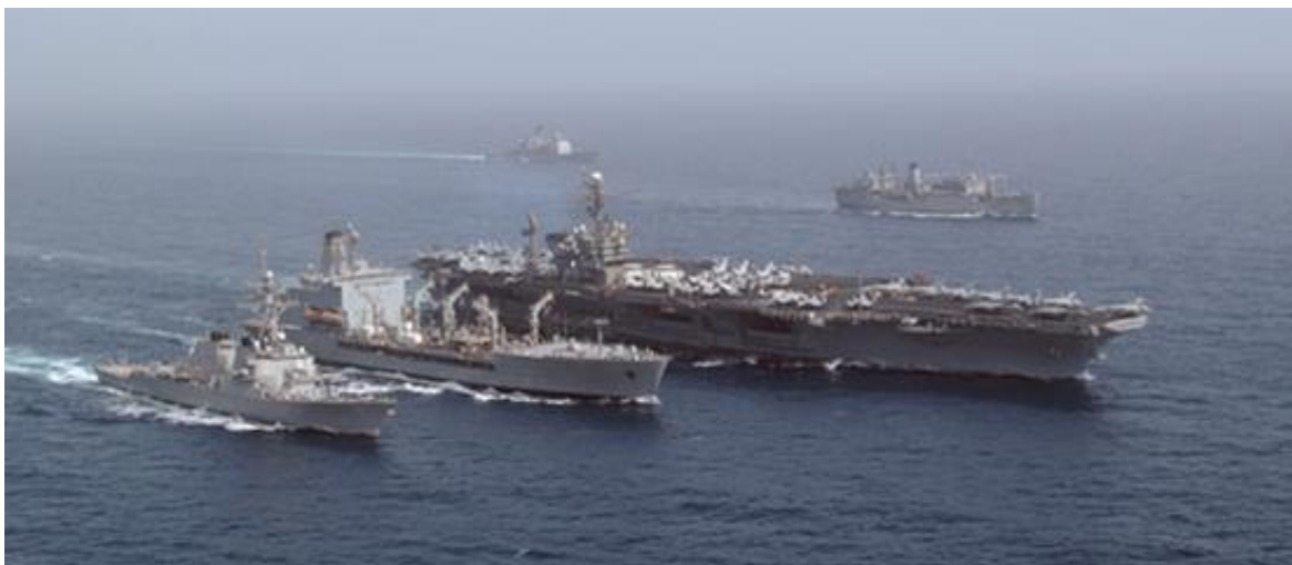
Figure 3. Fleet Oiler Conducting an UNREP

The Navy states that the photo is dated June 19, 2002, and shows the oiler Walter S. Diehl (TAO-193), at center, conducting simultaneous UNREPs with the aircraft carrier John F. Kennedy (CV-67) and the Aegis destroyer Hopper (DDG-70). CV-67, a conventionally powered carrier, has since retired from the Navy, and all of the Navy's aircraft carriers today are nuclear powered. Even so, Navy oilers continue to conduct UNREPs with Navy aircraft carriers to provide fuel for the carriers' embarked air wings.