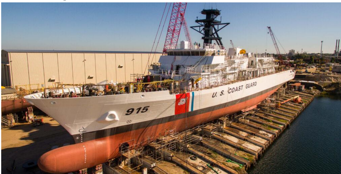
Figure 8. First Offshore Patrol Cutter Under Construction