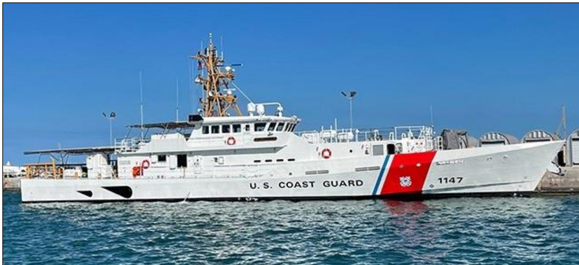
Figure 11. Fast Response Cutter