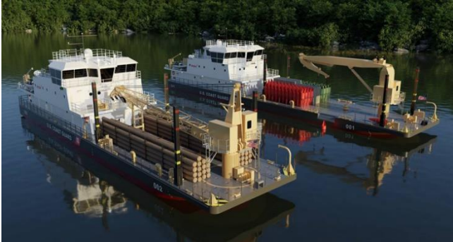
Figure 1. Notional Rendering of WLIC and WLR