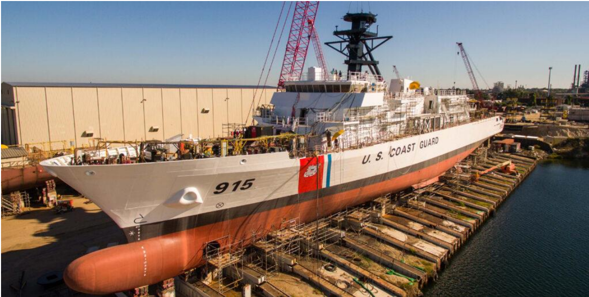
Figure 8. First Offshore Patrol Cutter Under Construction

Source: Photograph accompanying Chuck Hill, “Christening and Launch Ceremony for U.S. Coast Guard’s First Offshore Patrol Cutter Friday, October 27, 2023”—Eastern Shipbuilding,” Chuck Hill’s CG Blog , October 17, 2023. The caption credits the photograph to Eastern Shipbuilding.