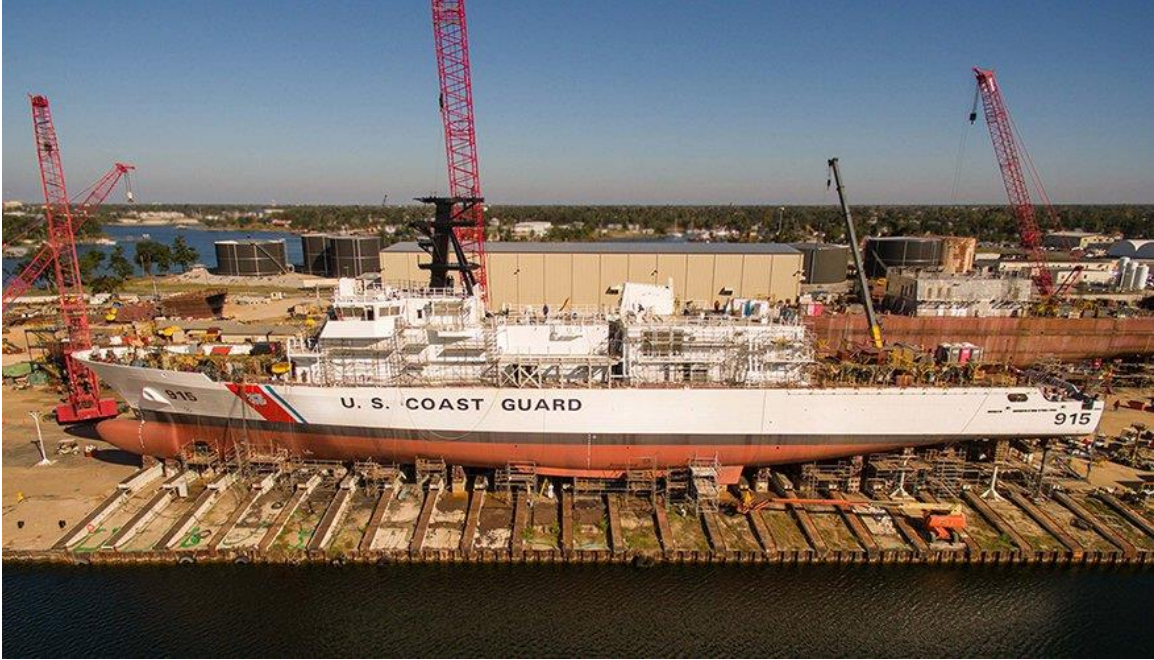
Figure 7. First Offshore Patrol Cutter Under Construction