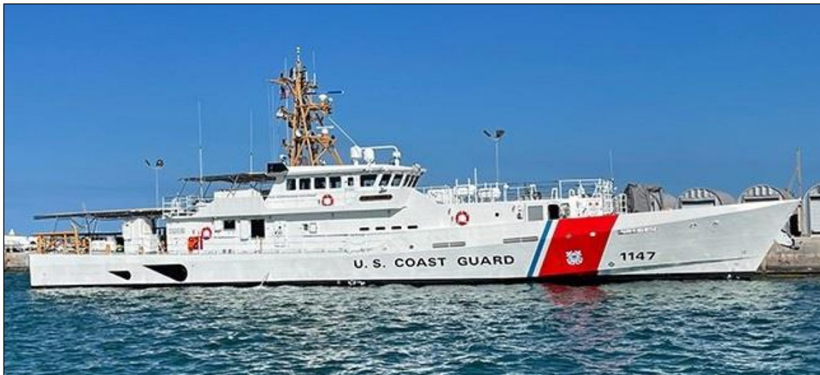
Figure 11. Fast Response Cutter